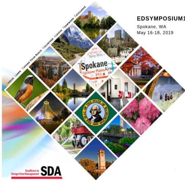
EDSYMPOSIUM19 Spokane, WA May 16-18, 2019

The SDA National Convention, EDSymposium19, will be held in Spokane, Washington, Thursday, May 16, 2019 through Saturday, May 18, 2019.