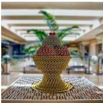
"Take a Scoop Out of Hunger" Driver URBAN / Driver SPG