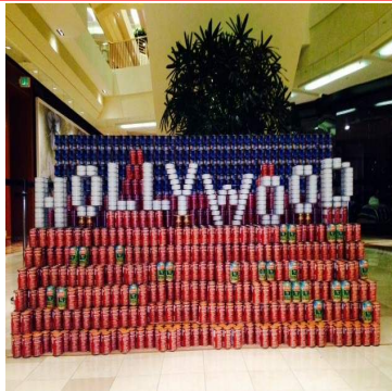
"Making Healthy Eating Famous" Technip Stone & Webster Process Technology