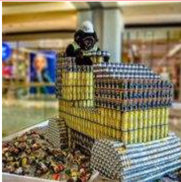
"Flatten Hunger" c/a ARCHITECTS