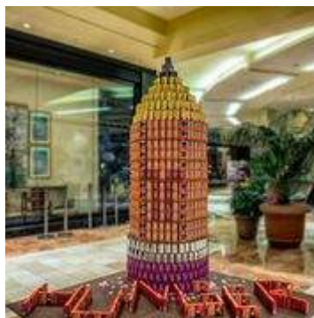
"Erasing Hunger" Terracon Consultants, Inc.