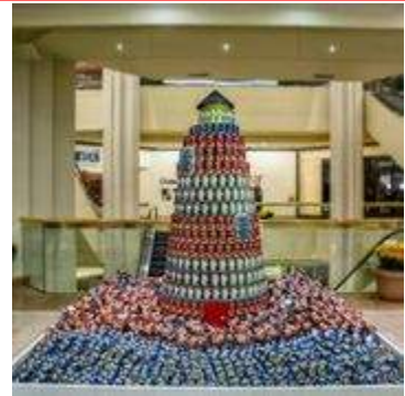
"A Beacon of Hope to Fight Hunger" Gensler