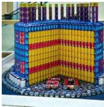
"Cut Out Hunger" RBF Consulting, Inc.