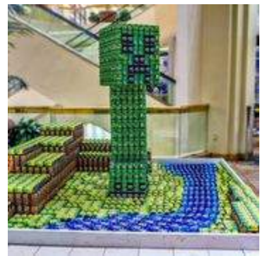
"Hunger CREEPS Us Out!" J.R. Miller & Associates