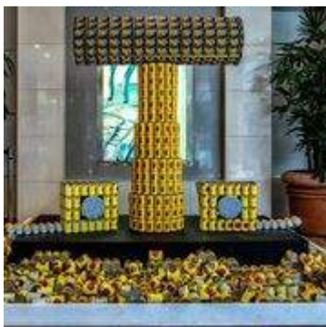
"Measure Up and Hammer Out Hunger" Building Trades Network