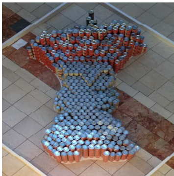
"Take a Bite Out of Hunger!" MVE & Partners, Inc.