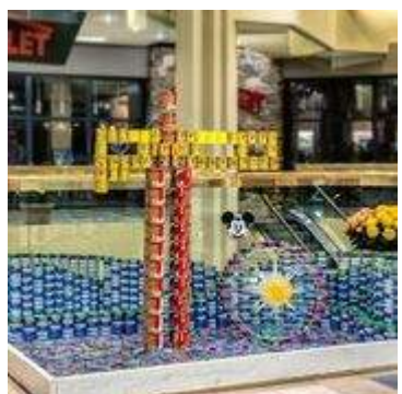
"There's No Hunger in Paradise" Hensel Phelps