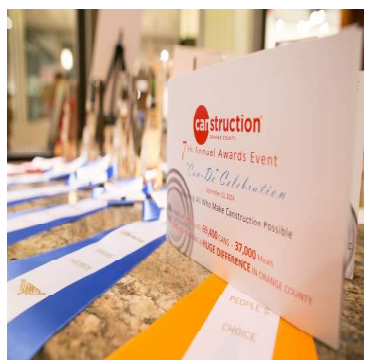
Construction 'Can-Do' Celebration Program & Ribbons