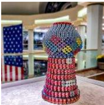
"Bursting Hungers Bubble" Hall & Foreman, Inc.